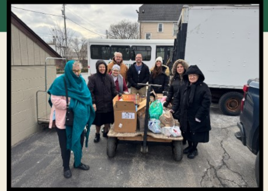
Staff and residents donating food to the Basilica of St. Josaphat Food Pantry

Clement Manor staff and residents actively engage in various community programs to enrich the lives of both residents and community members. These efforts foster meaningful connections and community involvement.