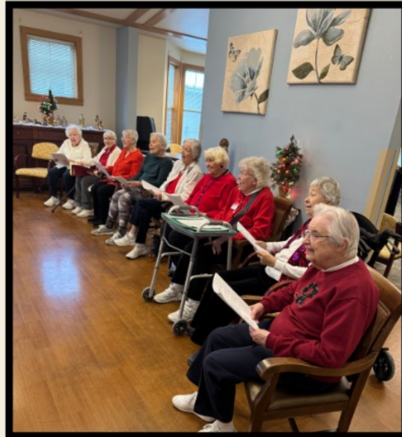
The resident choir sings to the residents at Our Lady of the Angels convent