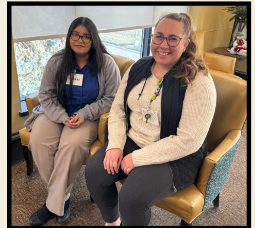
Students from Cristo Rey Jesuit High School participate in a work study mentor program at Clement Manor