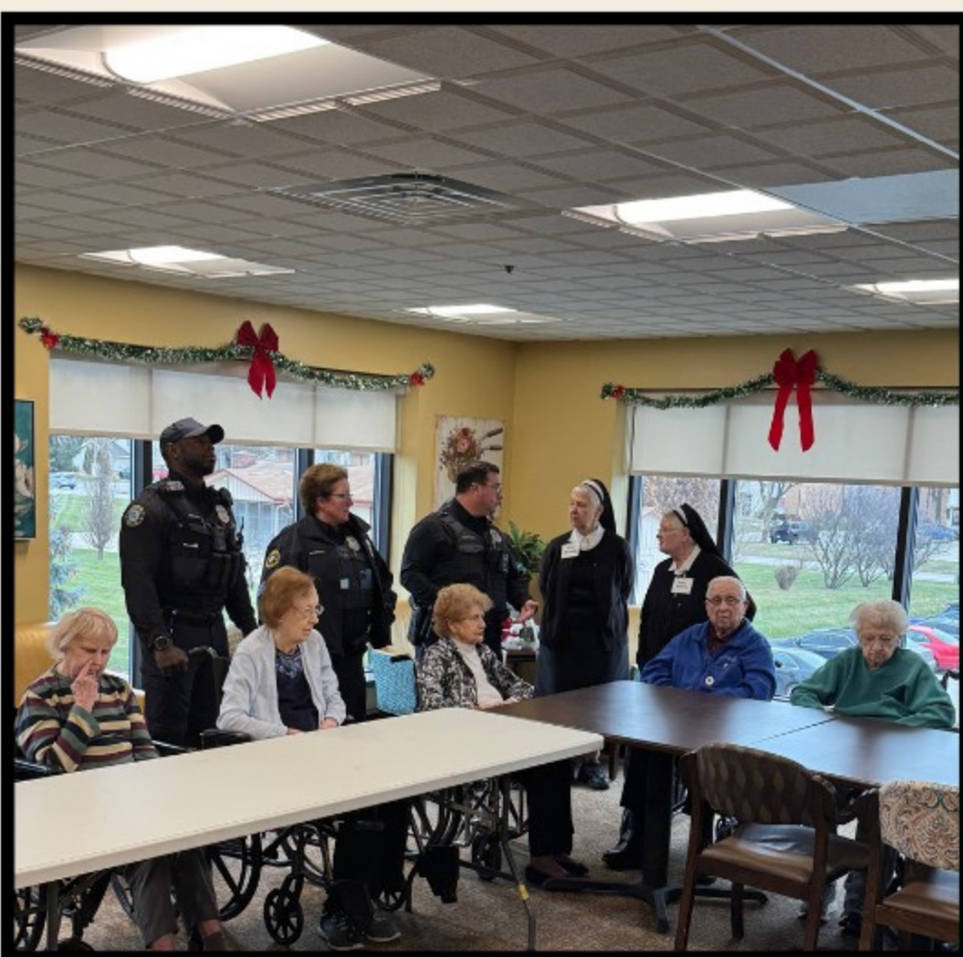
Clare Suites Memory Care residents and the FSCC Sisters pack survival kits for the homeless. Milwaukee Police District One distribute the items throughout winter