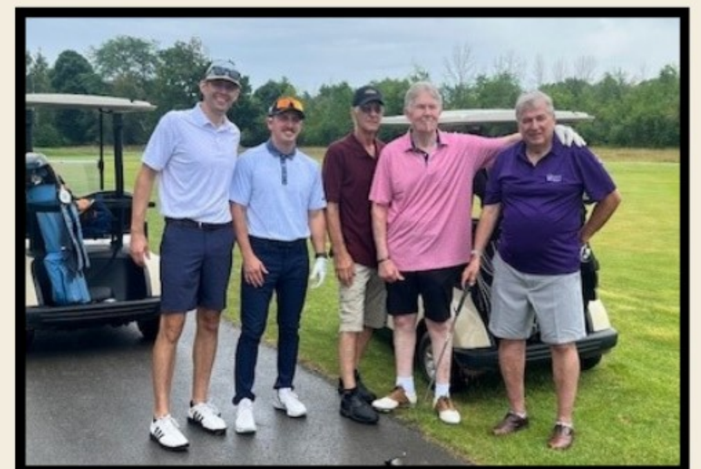
The Clement Manor Golf Classic raises about $60,000 annually for the greatest needs fund