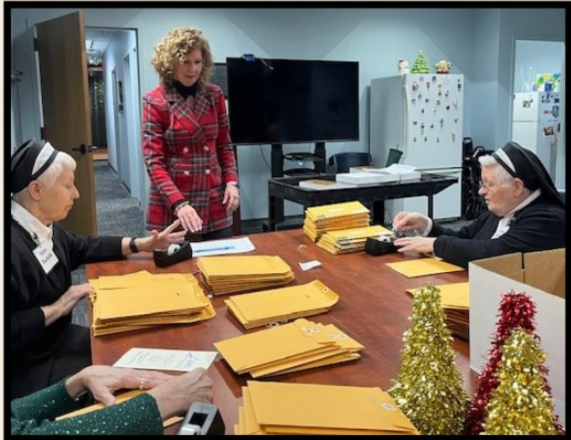
The Franciscan Sisters of Christian Charity volunteered at Eras Senior Network Holiday Gift Giving Day