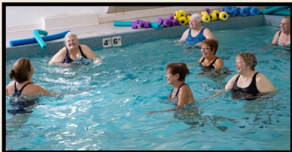
Community members participate in lifelong learning programs in our Center for Enrichment