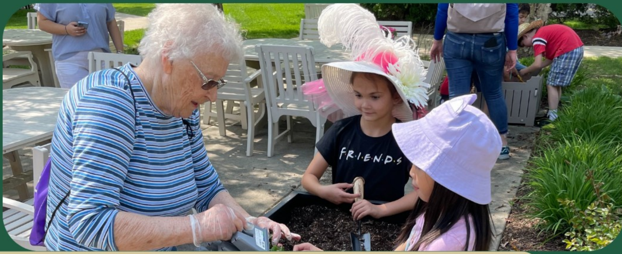
Students from St. John's the Evangelist Catholic School help with our intergenerational planting day