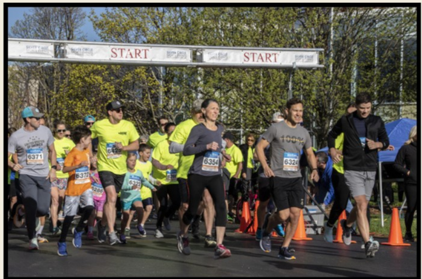
Clement Manor sponsors the VJS Community Foundation 5K Run/Walk benefiting local nonprofit organizations each year