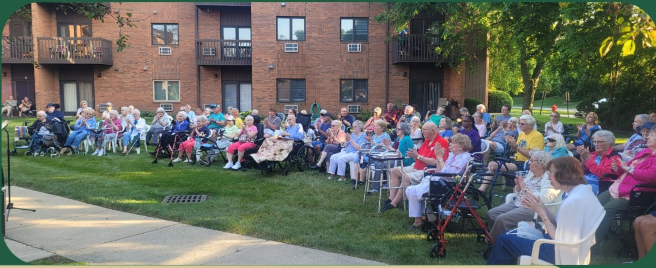
Clement Manor hosts a free Music Under the Stars Outdoor Music Concert Series for all residents and community members