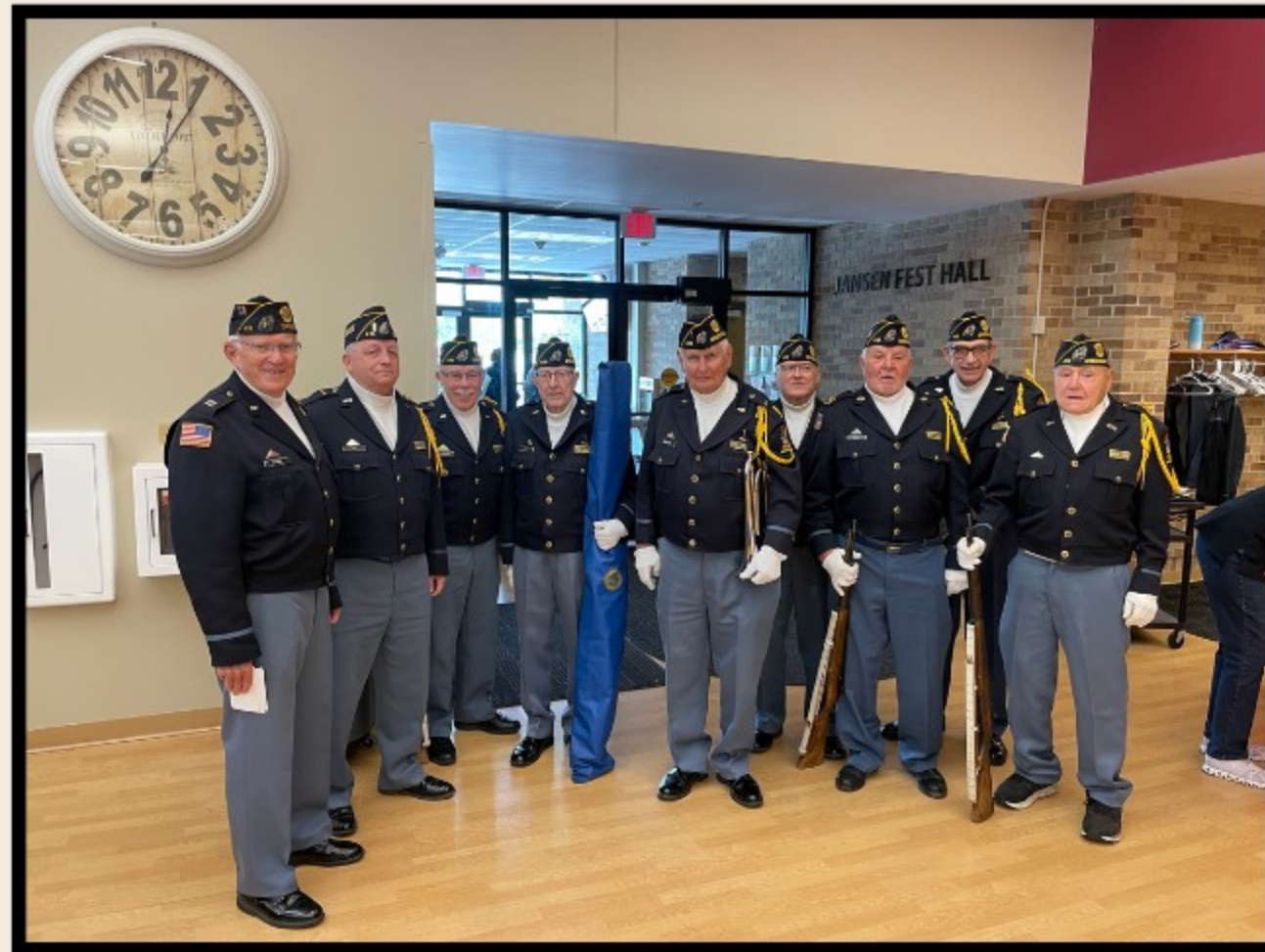
Clement Manor sponsors the City of Greenfield Senior Lunch and Learn events, including a Veteran's Day Tribute