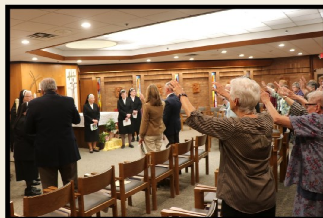
Blessings from the School Sisters of St. Francis to the Franciscan Sisters of Christian Charity