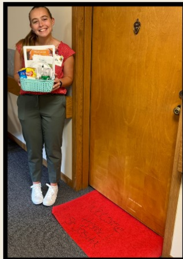
Administrative Intern from UW-Eau Claire welcomes new residents with a VIP red carpet experience