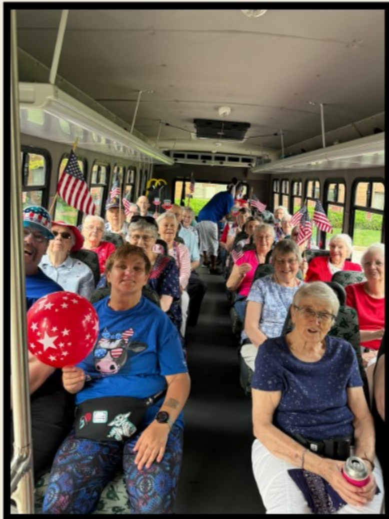
Residents participate in the Greenfield 4th of July Parade