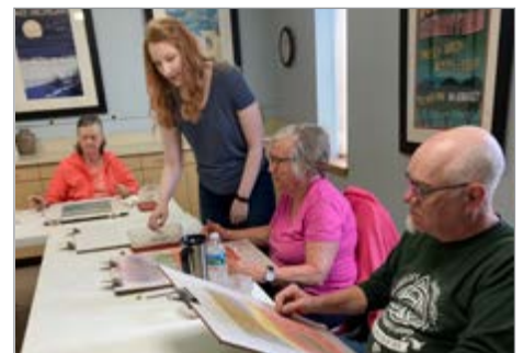
The residents and seniors from the surrounding community are offered a wide array of activities and learning opportunities at Clement Manor.