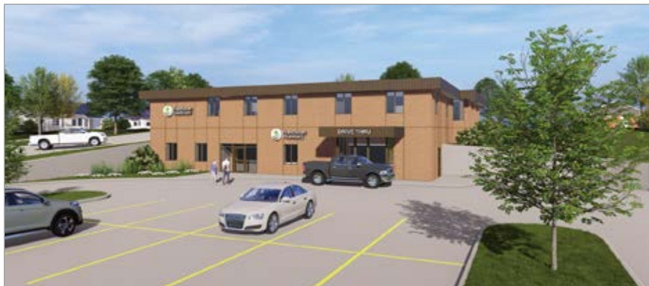
Architect's rendering of completed clinic/pharmacy in Oakland.

the leader in providing quality healthcare, promoting health and wellness in the communities we serve, and being the employer of choice.