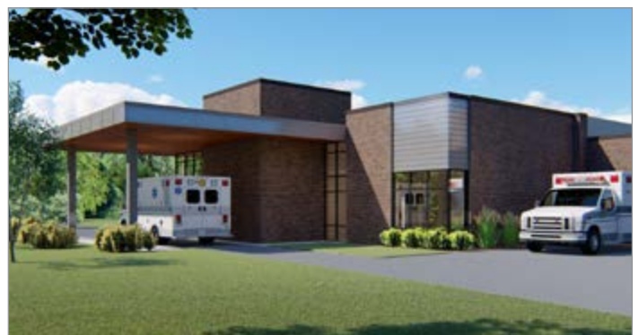
The new Center for Health Care Excellence on the Lakeshore Technical College campus.