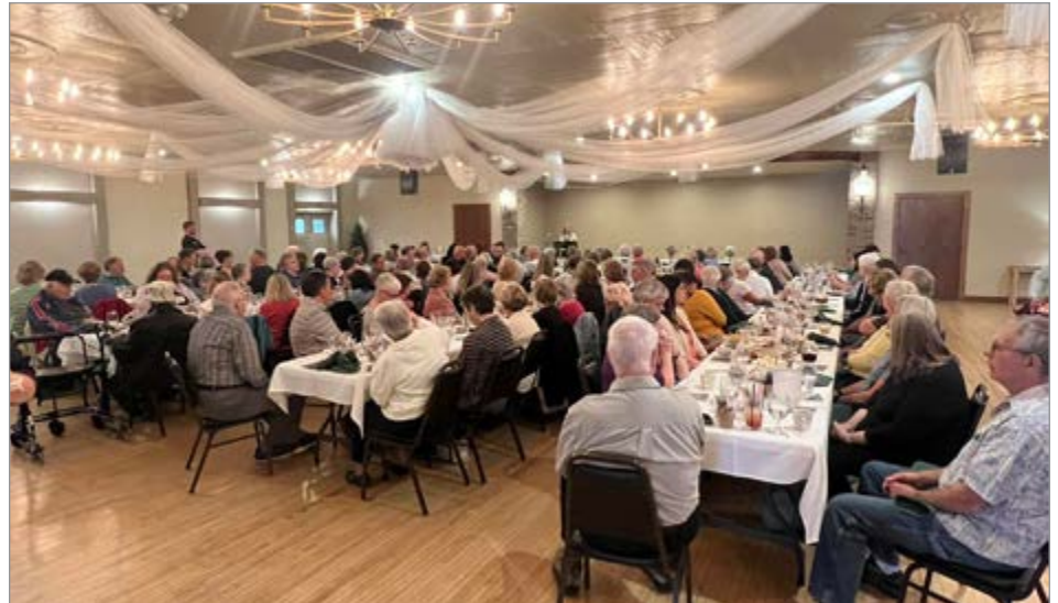
The Volunteer Appreciation Banquet for St. Paul Elder Services.

veteran himself, for Veterans Day 2023, he asked to hold a special veteran social at happy hour, where he recognized each veteran individually with what branch of military they served, what years they served, and what job they had during their service. He then provided each of them with a gift. I knew then I wanted to make him our volunteer of the year.”