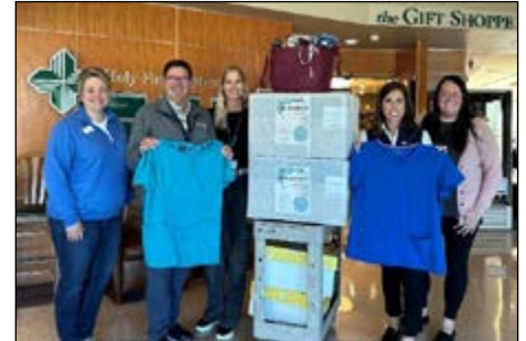
FHFMH partners with LTC throughout the year. We hosted a gently used scrubs drive and 500 items were donated to LTC students to use in clinical work.

“The Froedtert & the Medical College of Wisconsin health network has a long history of partnering with educational institutions with a strong local presence that are committed to providing educational opportunities to those who live and work in the diverse communities we serve,” said